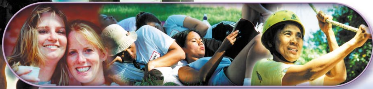
high valley ranch - clearlake oaks, california